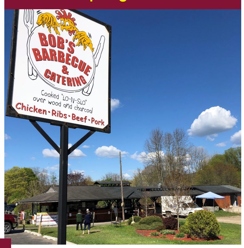
Bob's BBQ is open every Thursday through Sunday on Route 281 in Homer.

Bob's barbecue cooks "Low-n-Slo" on wood and charcoal, with a secret recipe that they're not sharing outside the family. You can find them at 5290, Route 281 in Homer. They're open from 11 a.m. to 8 p.m. from mid-April through October.