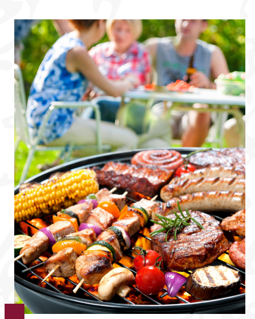
Don't let your backyard party turn into an insurance claim.